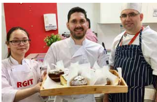
👍 RGIT's newest Melbourne Patisserie students sharing their sponge cake creations