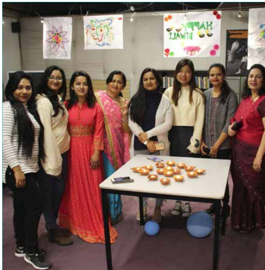
👍 RGIT Australia Early Childhood Education and Care (ECEC) students had fun celebrating Diwali, the Hindu festival of lights, at Victoria House Campus.