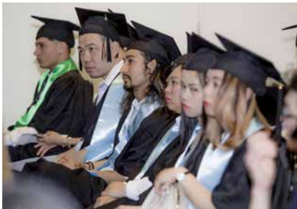
👍 Congratulations, RGIT Australia 2018 Melbourne graduates!