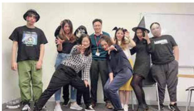
👍 Trick or treat!