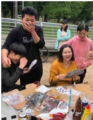
👍 Cards are war, in disguise of a sport.